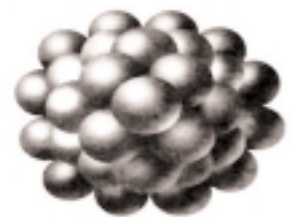
SILICA PARTICLES FORMING A MICROCLUSTER®